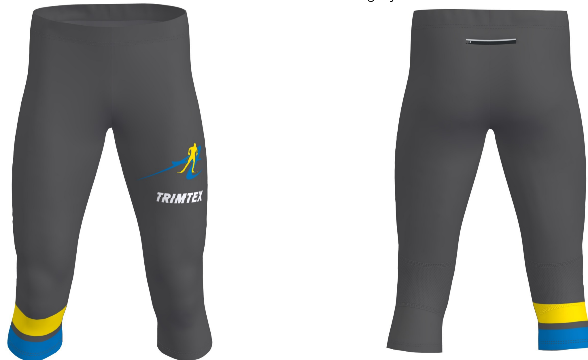
B234-LVZ RUN 2.0 3/4 TIGHTS D6 zippers + reflex piping: Black 580 thread: Dark gray 9686 flatlock: Dark gray U9972