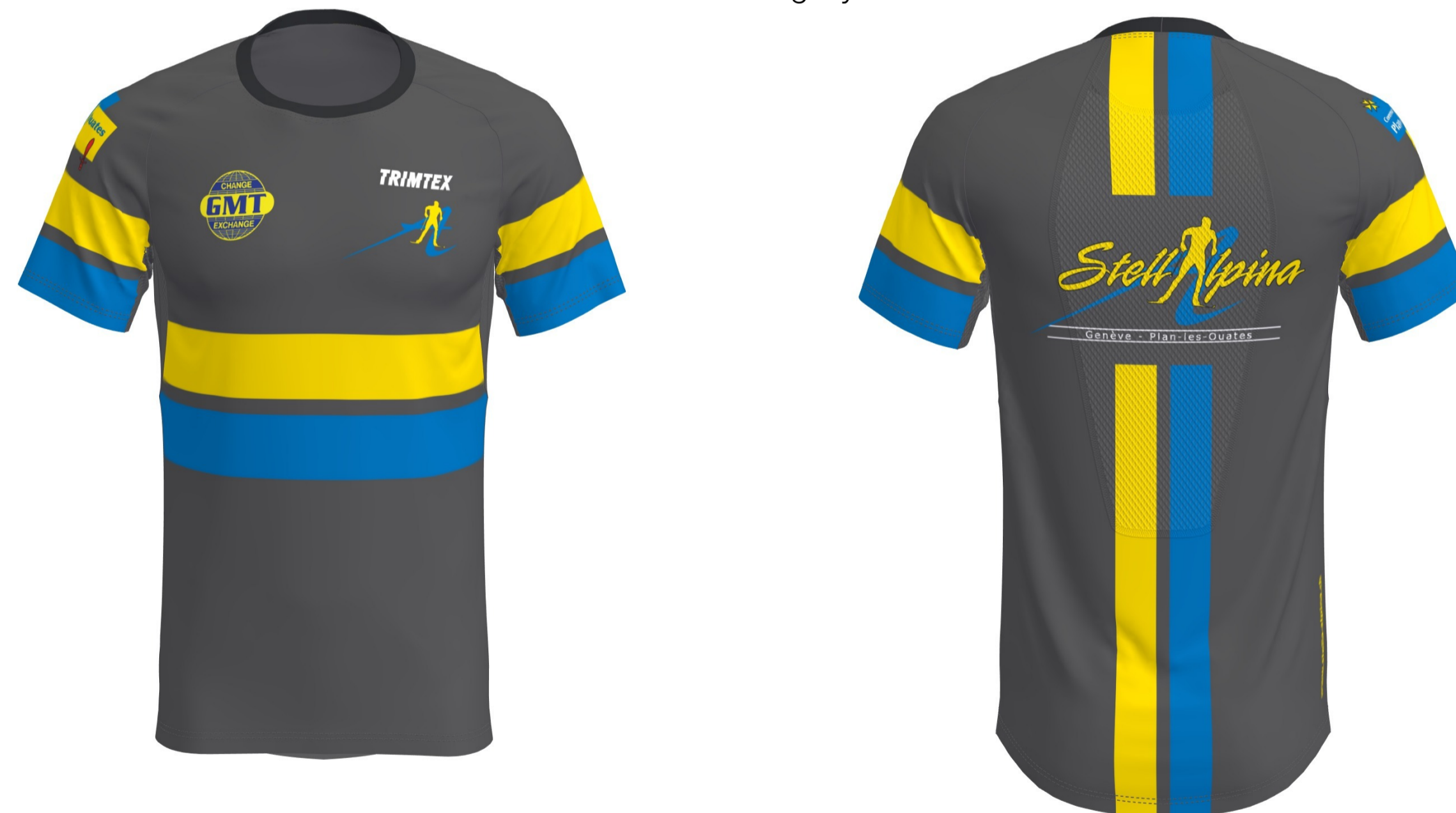
C51.2-LVZ/SS RUN T-SHIRT D6 thread: Dark gray 9686 flatlock: Dark gray 9686