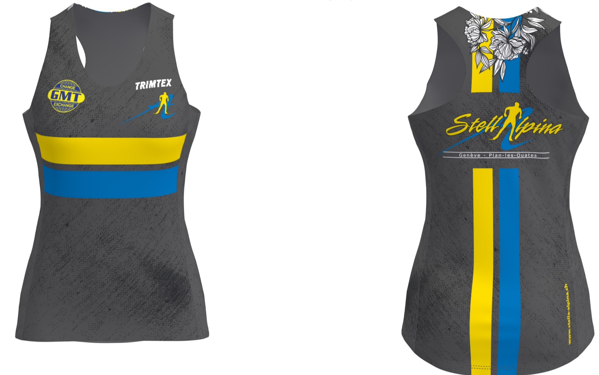
C18.2-L RUN WOMENS SINGLET D2 thread: Dark gray 9686 flatlock: Dark gray 9686