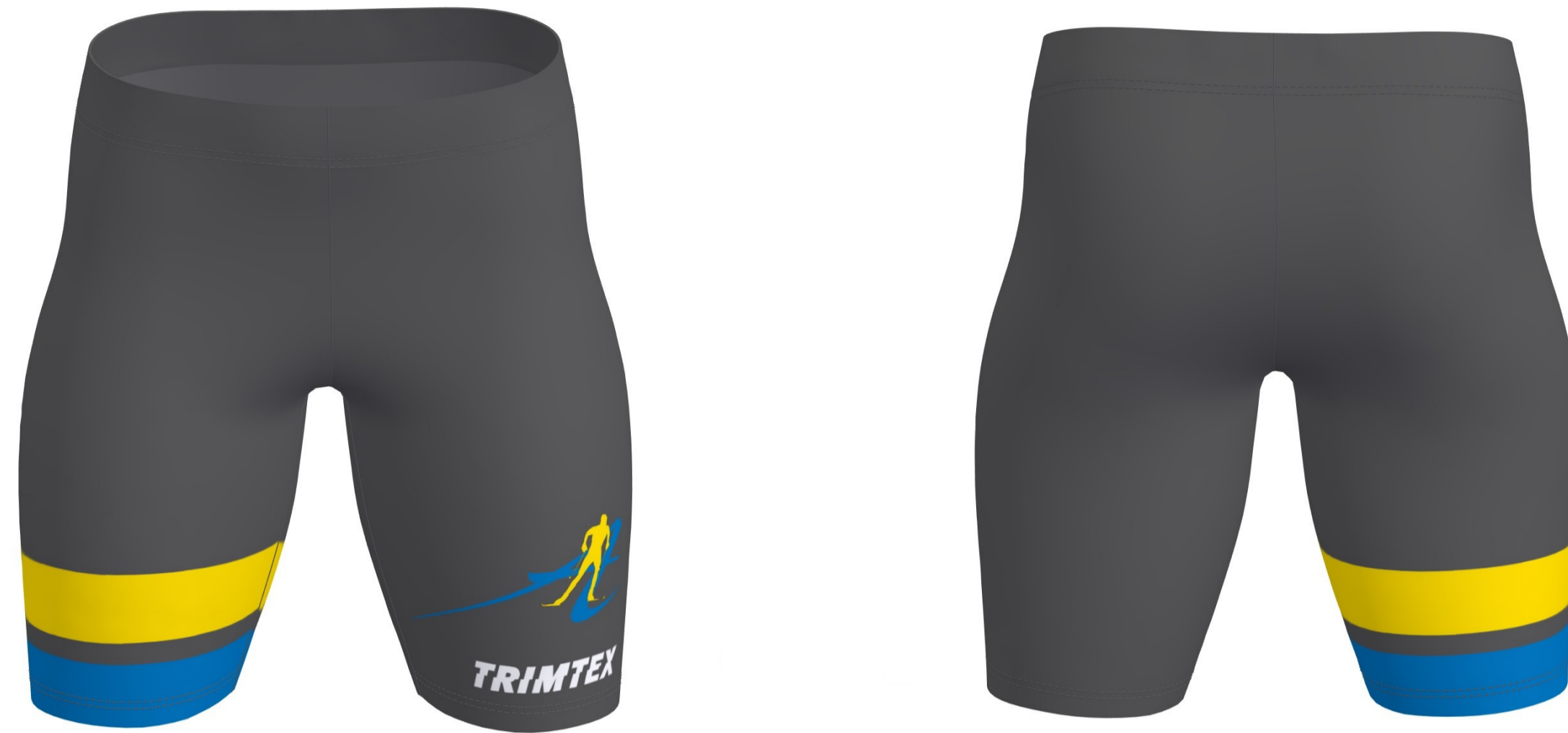
B237-L RUN 2.0 SHORT TIGHTS D6 thread: Dark gray 9686 flatlock: Dark gray U9972