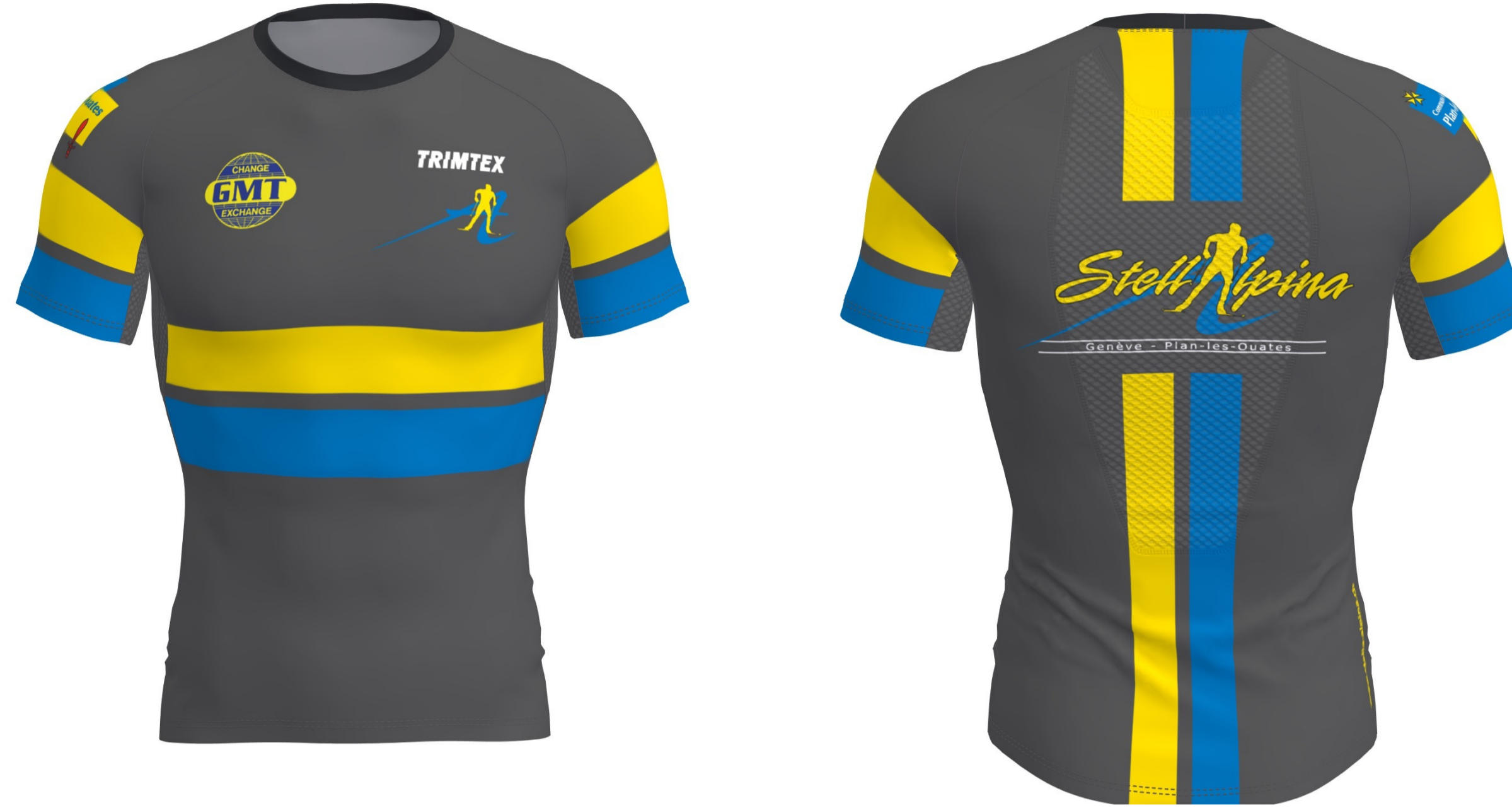
C21.1-LVZ/SS FAST T-SHIRT D6 thread: Dark gray 9686 flatlock: Dark gray 9686