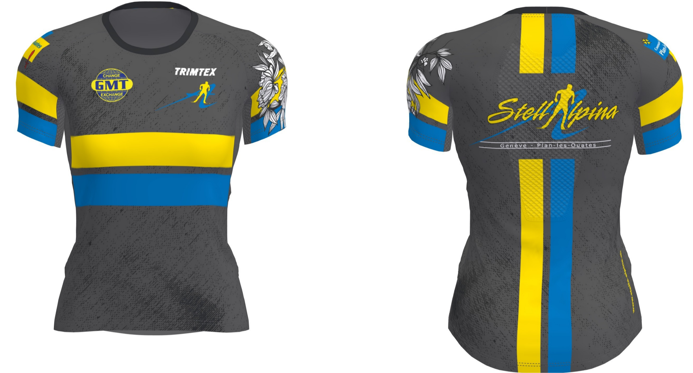
C22.1-LVZ/SS FAST WOMENS T-SHIRT D2 thread: Dark gray 9686 flatlock: Dark gray 9686