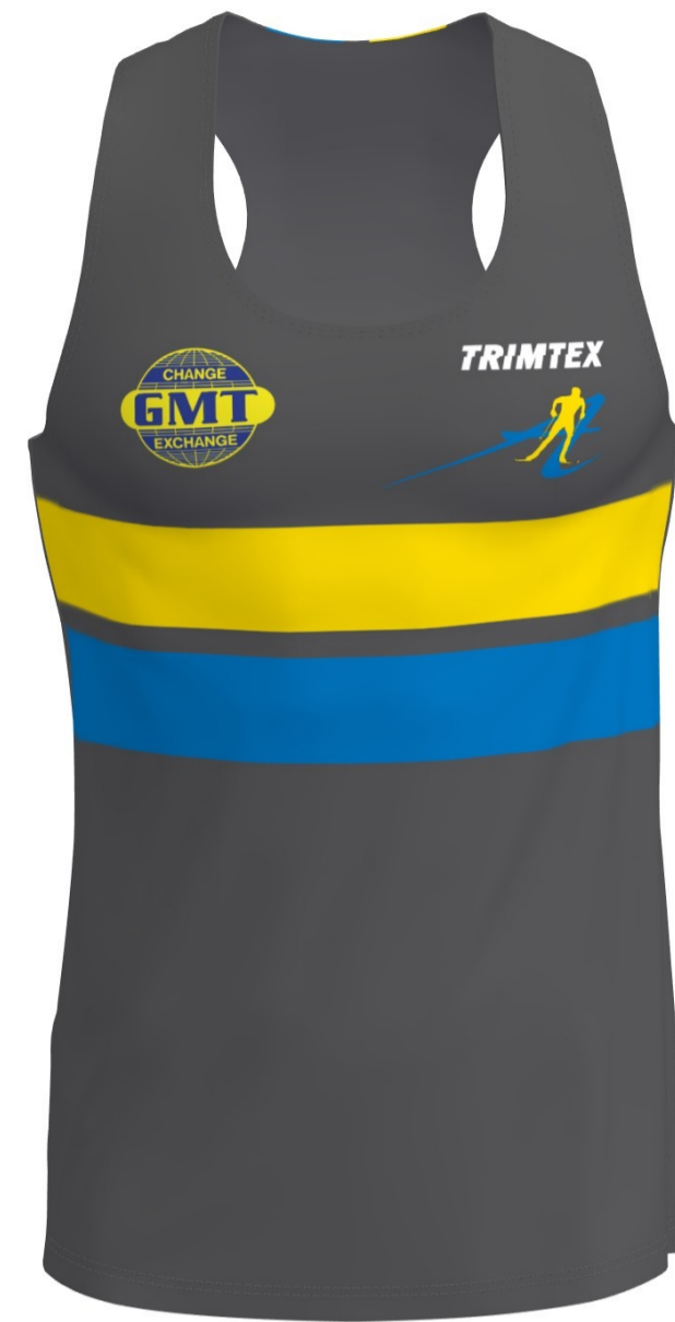
C23-L FAST SINGLET D6 thread: Dark gray 9686 flatlock: Dark gray 9686